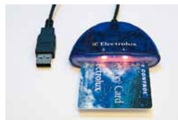
USB card reader

Card reader and memory card included in the software, "Wash Program Manager" kit