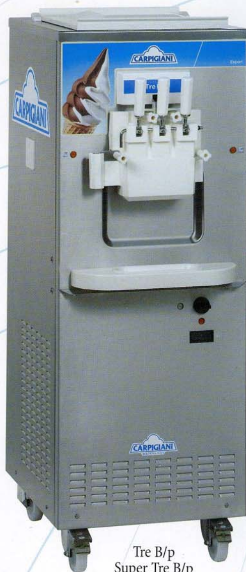
Tre B/p Super Tre B/p