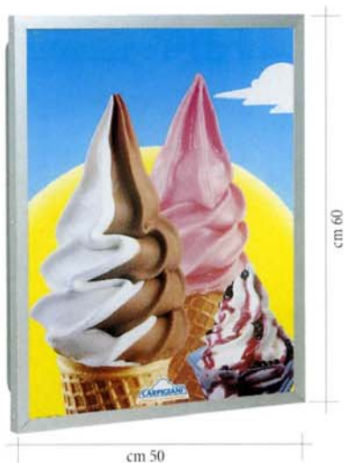
Luminous Display for Soft Ice-Cream