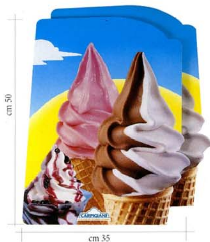
Double sided Rotors for the Soft Ice-Cream

code 757900078 - 350 mm x 500 mm (h) in adhesive PVC to affix to the shop window to tempt passers-by to buy the product.