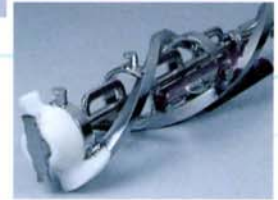
- R pump - 3X beater for high overrun