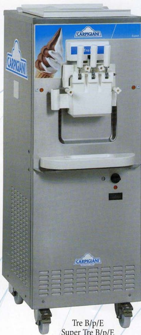
Tre B/p/E Super Tre B/p/E

W heel-mounted and water- or air-cooled, they can be located and shifted easily, wherever convenient.