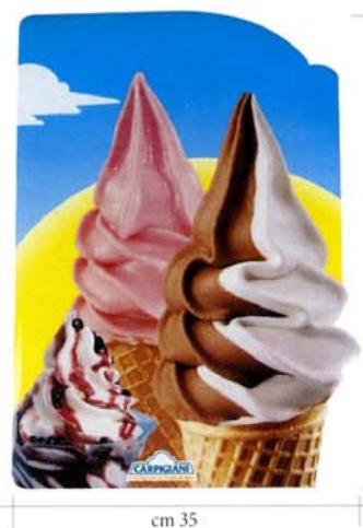
Glass Display for the Soft Ice-Cream

CARPIGIANI tecnologia per un mondo più dolce