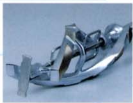
- R pump - 2E beater for high overrun