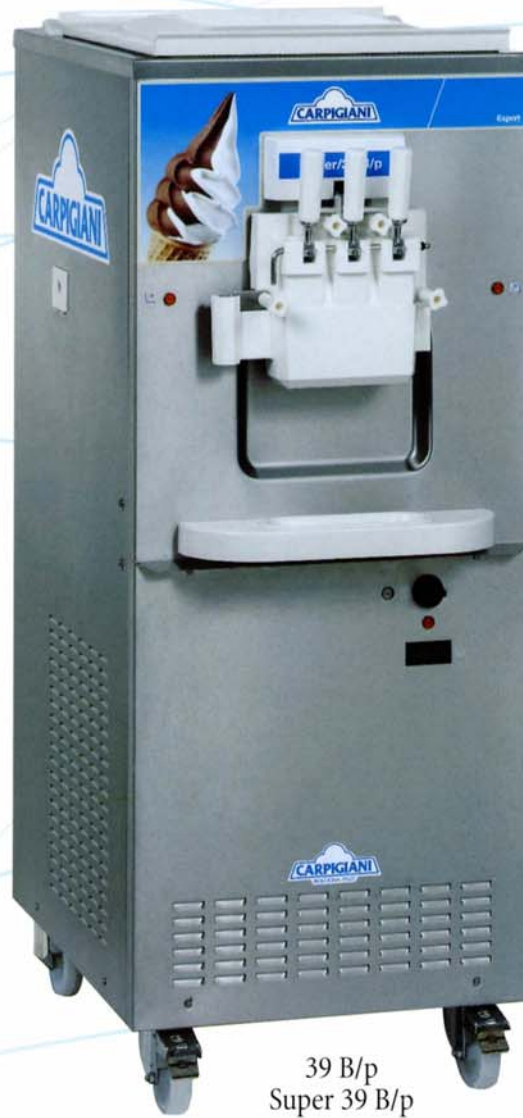
39 B/p Super 39 B/p