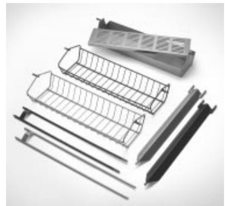
Clockwise from lower left: Piercing spits, wire baskets, solid bottom basket with grid, angled spits.

Rotisserie Spit Stand, RSS-012 or RSS-016, a convenient mobile stand to aid in loading, unloading, and transporting rotisserie product. See separate data sheet for Rotisserie Merchandising.