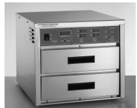
HCD-932 with countdown timer module and recessed drawer handles.