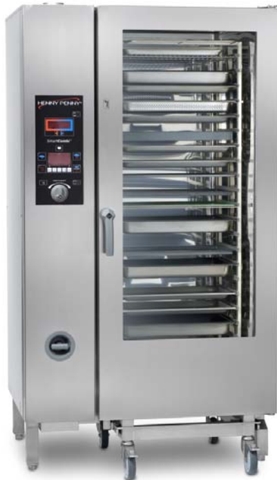
SmartCombi model ESC-215

The ESC/GSC-215 has a capacity of (20) full-size steam table pans 2 ½ in. (65 mm) or (20) Crosswise Plus pans and grids.